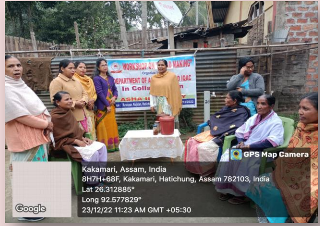
Kakamari, Assam, India 8H7H+68F, Kakamari, Hatichung, Assam 782103, India Lat 26.312885° Long 92.577829° 23/12/22 11:23 AM GMT +05:30