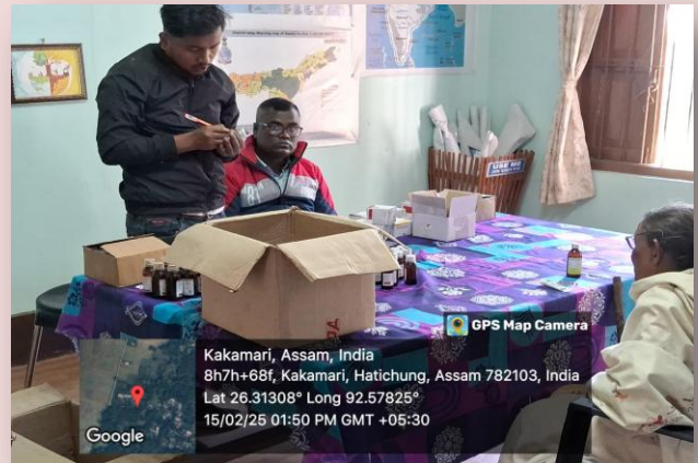
Kakamari, Assam, India 8h7h+68f, Kakamari, Hatichung, Assam 782103, India Lat 26.31308° Long 92.57825° 15/02/25 01:50 PM GMT +05:30