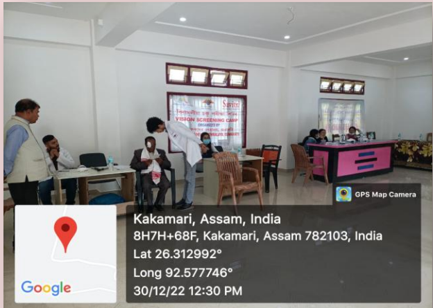
Kakamari, Assam, India 8H7H+68F, Kakamari, Assam 782103, India Lat 26.312992° Long 92.577746° 30/12/22 12:30 PM