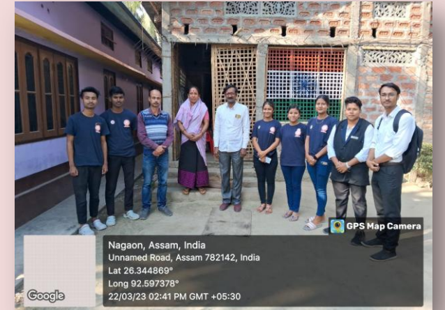
Nagaon, Assam, India Unnamed Road, Assam 782142, India Lat 26.344869° Long 92.697378° 22/03/23 02:41 PM GMT +05:30