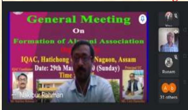
Online Alumni General Meeting