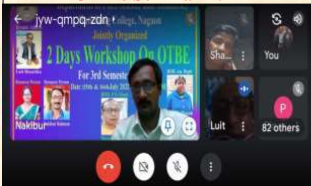
Online Workshop on OTBE