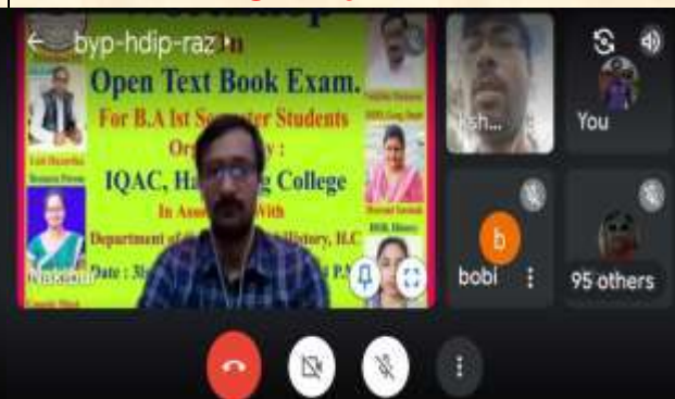
Online Workshop on OTBE