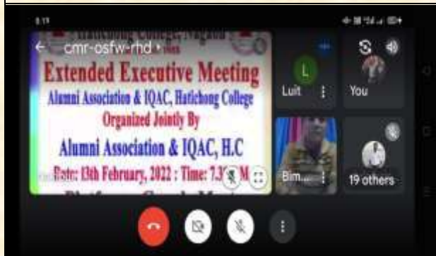
Online Alumni Extended Meeting