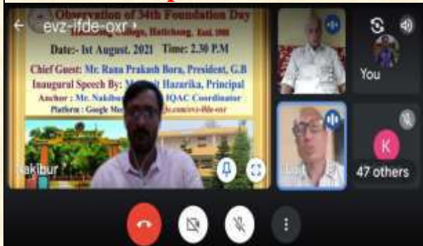
Online Observation of Foundation Day