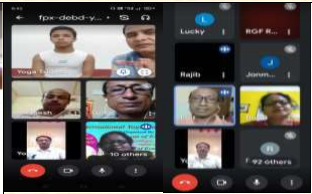
Online Yoga Camp