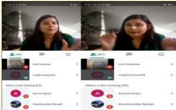
Online Certificate Course