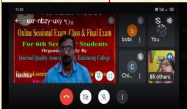
Workshop on Online Exam