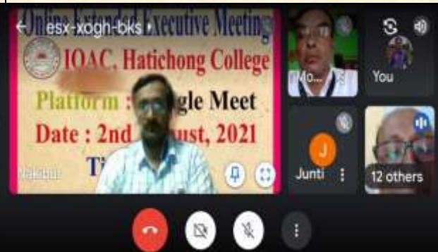
Online IQAC Meeting