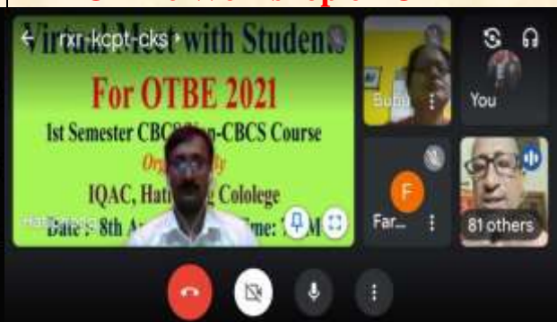
Virtual Meet on OTBE